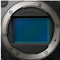
Sensor in AW-UB50

The AW-UB50 boasts a 24.2-megapixel full-size MOS sensor and the AW-UB10 features a 10.3-megapixel 4/3-inch MOS sensor, both realizing high-quality video with excellent color reproduction and resolution. The high-sensitivity, large-format sensors achieve a shallow depth of field for emotional expressiveness with beautifully blurred backgrounds. In addition, detailed expressions can be captured even in low-light environments thanks to wide dynamic range (AW-UB50: 14+ stops / AW-UB10: 13 stops).