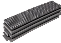
1755AirFS 4 pc. Replacement Foam Set