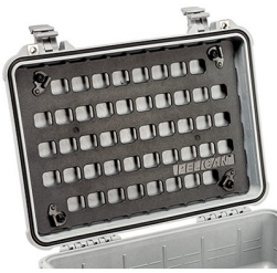
1500MP EZ-Click™ MOLLE Panel