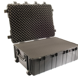
1730WF With Foam