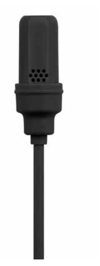
UL4B UniPlex Directional Subminiature Lavalier Microphone (Black)

*NOTE: Shure UniPlex UL4 lavalier microphone with LEMO termination is compatible only with Shure LEMO bodypack transmitters and preamplifiers.