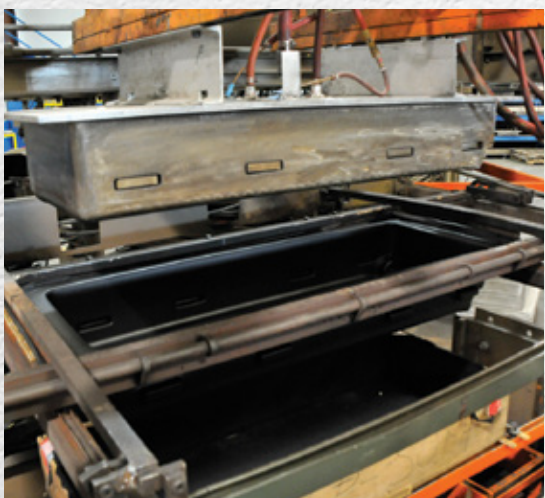
Vacuum mold for keyboard case

In 1997, SKB invested in roto-mold machinery. These molds are ideal for making large and cylindrical cases. The PE roto-mold material starts as a fine powder that is measured according to the size of the case. The material is then sealed up in a multi-piece aluminum mold, fixed on a biaxial rotating wheel, and heated to 800° in a very large oven while the mold constantly rotates. The powder melts and coats the inside of the mold and, after cooling, the cast is disassembled and the new case is removed. Roto-molding is great for providing maximum transport protection and impact resistance.