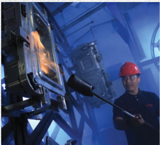
Molds rotating during production

This is SKB's latest venture in our quest to provide the most innovative hard shell case products. Injection molding is an expensive investment that leaves no room for error. Made with extreme pressure, even the smallest injection molded part requires a very large and heavy mold (some of SKB's molds are nearly 20 tons!). The injection mold process produces many of our parts—such as our patented Trigger Latches—and our gasket-sealed waterproof iSeries cases are proving to be popular transport solutions for everyone from touring musicians to military personnel. Never before has an ATA flight case been so advanced and lightweight.