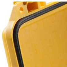
1153 Replacement O-ring