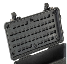
1510MP EZ-Click™ MOLLE Panel