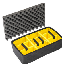
1515 Padded Divider Set