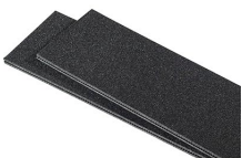
1510TPDIV Extra TrekPak Dividers