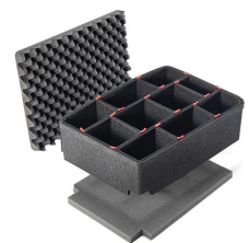
1510TPKIT TrekPak Case Divider Kit