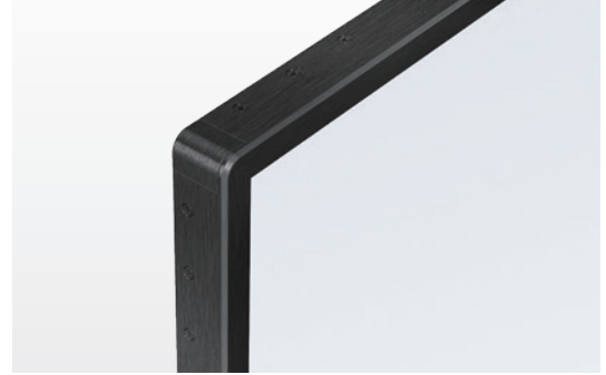
Quality design and materials